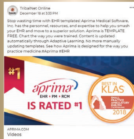
Example: Custom Social Media Post